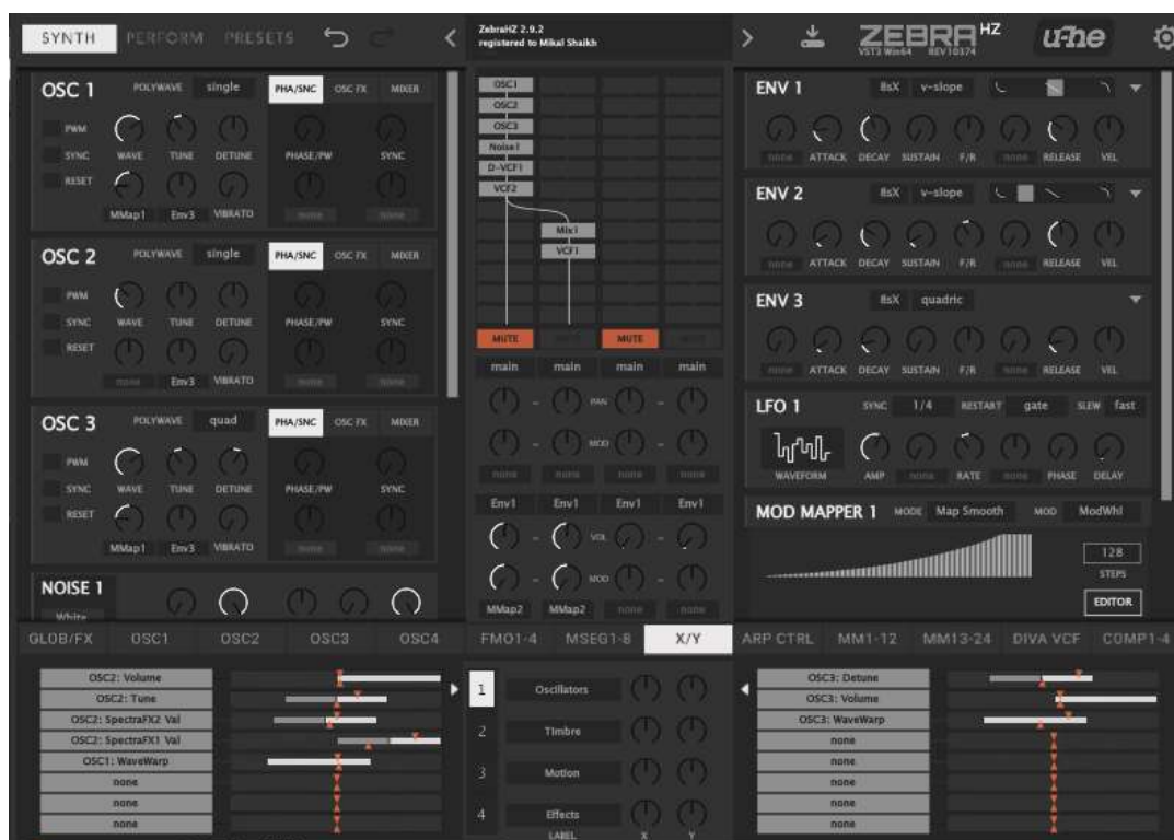
Resistent's White Dust