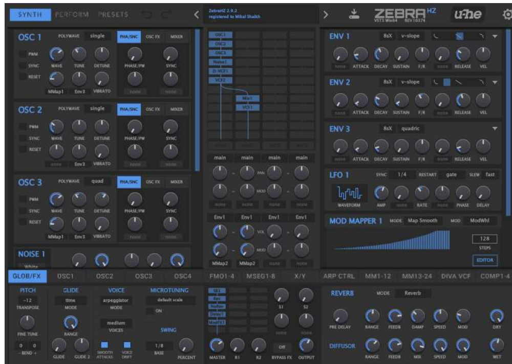
STANDARD: Single Color Blue