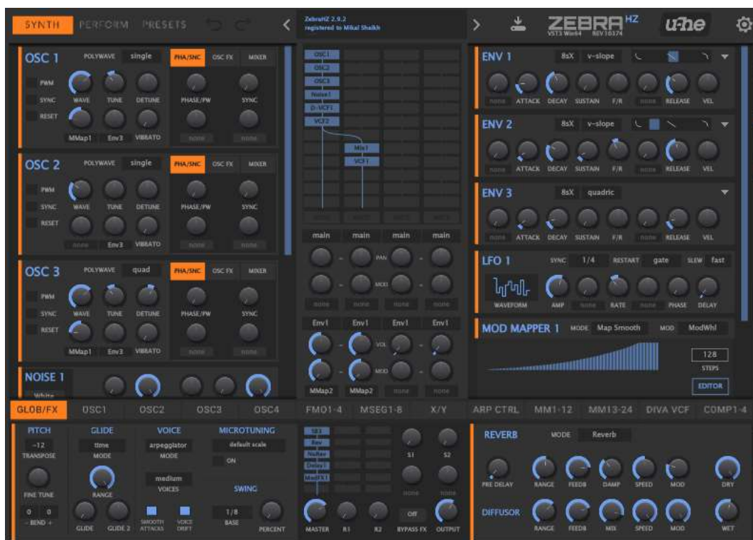
Out of Phase